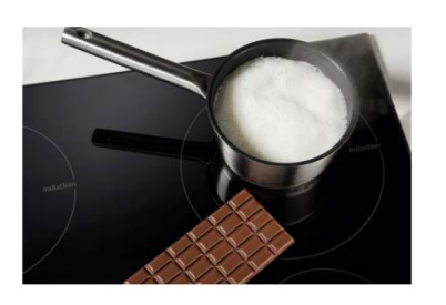
Induction heating technology Cleverly recognises the size of your pots and pans and saves you money on energy and bills. No