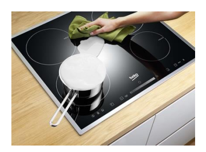
Easy to clean induction hob

Flexible induction zones offer the advantage of combining two hob zones into one using the Touchslider control.