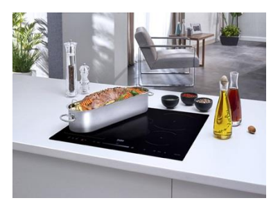
Flexible induction zones

Flexible induction zones offer the advantage of combining two hob zones into one using the Touchslider control.