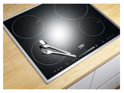
Maximum safety induction hob

Spillages from pans won't stick to the hob surface. Due to an induction hob's electromagnetic cooking technology.